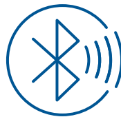
Built in Bluetooth connectivity