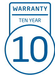
2-year warranty as standard, with 10-years on the inner stainless-steel tank